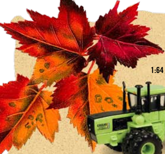
ZFN14749 1:64 Steiger Cougar PTA 280 Series III Pack: 12 • Available January 2010